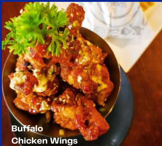
Buffalo Chicken Wings