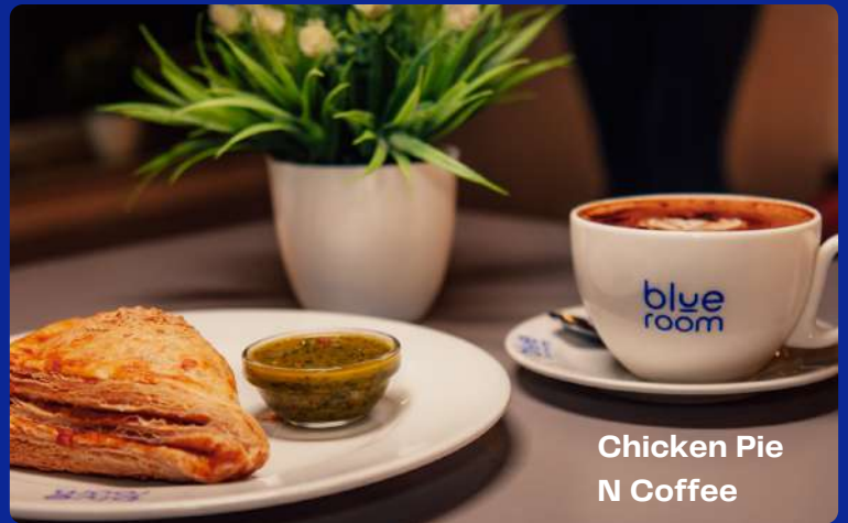
Chicken Pie N Coffee