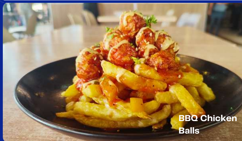
BBQ Chicken Balls

Extras Cheddar cheese 150/- | Mushrooms 100/- | Egg 150/- Beef patty 250/- | Chicken breast 250/-